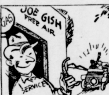
ONE THING ABOUT THIS FLAMING YOUTH YOU HEAR SO MUCH ABOUT, IT'S SOMETHING TIME IS SURE TO CURE!

Members of the Springfield Methodist church were busy at the church this morning cleaning the entire building from top to bottom. Men and women alike were doing their share in the general clean-up