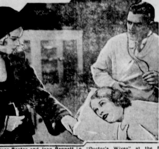
Warner Baxter and Joan Bennett in "Doctor's Wives" at the Fox McDonald next Wednesday and Thursday.