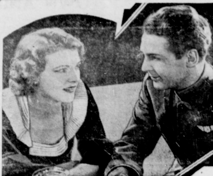
A scene from "Body and Soul" starring Chas. Farrell and Elissa Landi, at the Fox McDonald, Sunday to Tuesday.