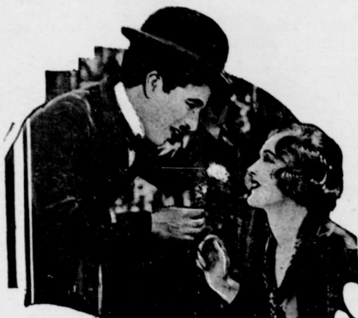
Charlie Chaplin and Virginia Cherrill in a scene from "City Lights", a United Artists production.