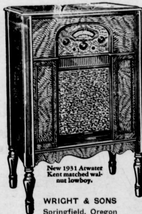
New 1931 Atwater Kent matched walnut lowboy.