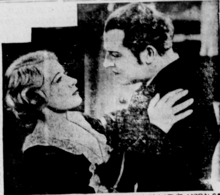
GRACE MOORE and REGINALD DENNY in "A LADY OF MORALS" Fox Rex, Wednesday and Thursday, February 4 and 5.