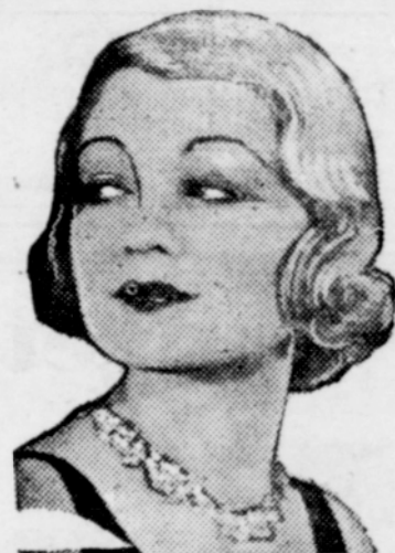
Constance Bennett starring in "Sin Takes A Holiday", a Pathe Picture.