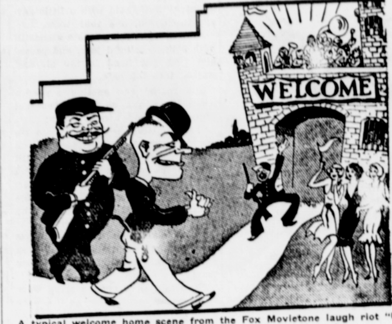
A typical welcome home scene from the Fox Movietone laugh riot "Up The River," at the McDonald Friday and Saturday.