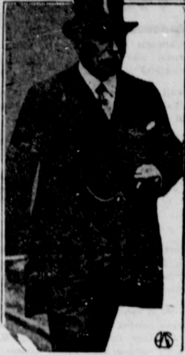
J. P. Morgan, greatest private banker, photographed as he attended the commencement exercises at Harvard University.