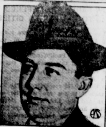
Alfred (Jake) Lingle, Chicago police reporter, slain by gunmen. Chicago newspapers have offered rewards totaling $50,000 for the discovery of the murderers.