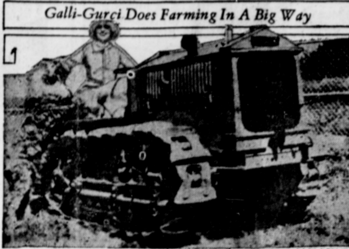
Galli-Gurci Does Farming In A Big Way

Amelita Galli-Gurci, famous opera prima donna, shown seated on the tractor she owns and uses on her estate "Sul Monte", near Highmount, N. Y.