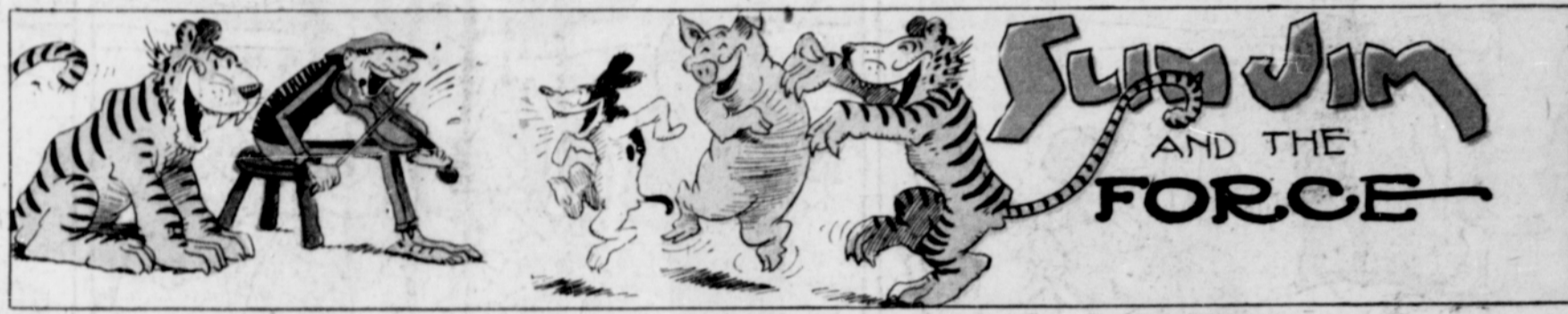
(Pat. Applied for—Serial No. 21764) The World Color Ptg. Co., St. Louis, Mo.