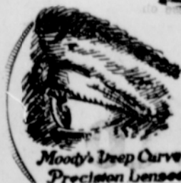
Moody's Deep Curve Precision Lenses