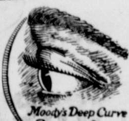
Moody's Deep Curve Precision Lenses