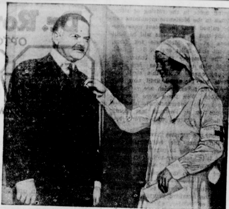
President Hoover, who is also president of the American Red Cross, enrolls in the annual Roll Call of the society, which occurs from Armistice Day to Thanksgiving Day, November 11 to 28.