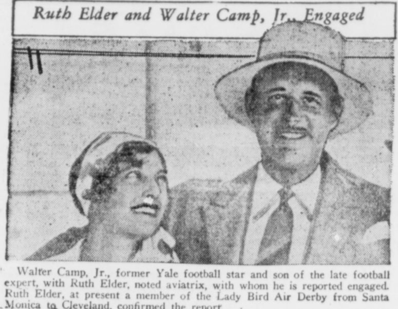
Walter Camp, Jr., former Yale football star and son of the late football expert, with Ruth Elder, noted aviatrix, with whom he is reported engaged. Ruth Elder, at present a member of the Lady Bird Air Derby from Santa Monica to Cleveland, confirmed the report.

Lee Tracy and Mae Clarke, both recently prominent on Broadway, are entrusted with the leading roles in this backstage romance, which will open Friday at the McDonald in Eugene. Tracy appears as "Eddie Burns," a small time hooper with an overdeveloped sense of his own importance, who is taught a lesson in humility of which he is so much in need.