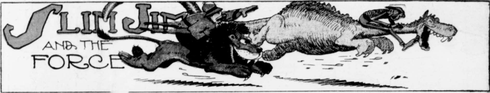
(Pat. Applied for—Serial No. 21764) The World Color Prtg. Co., St. Louis, Mo.