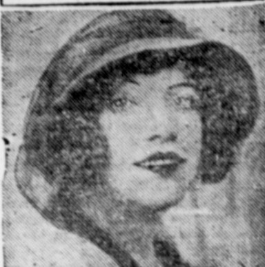
Texas Guinan, Queen of the New York night clubs, recently acquitted when on trial for alleged violation of the prohibition laws.

to them. And say, it's wonderful to drive in your own farm gates—see the well cultivated ground—the fine home that's all paid for, and say: 'Gee, I'm glad to get away from the city mess.' Farms aren't uncomfortable any more. People go to them to recuperate from illness.