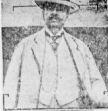
Gen. Juan Vincente Gomez, 72, unanimously elected to the presidency of Venezuela, declined, saying that he wished to return to agricultural work. He had been in power since 1909.