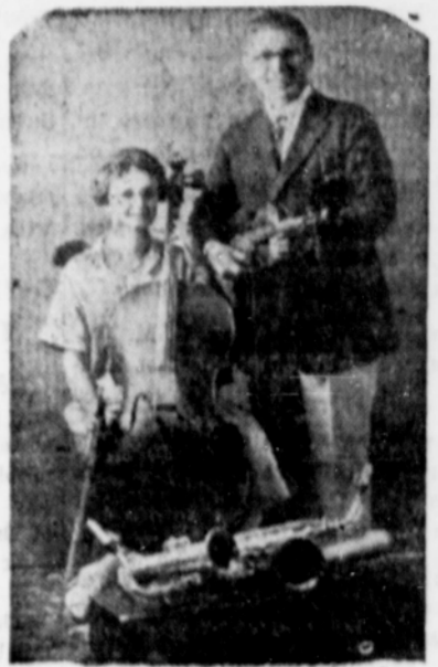
"You'll Like the Rosses"

LOST—Pair Heavy Rim Glasses on Main Street Wednesday morning. Return to News Office. J31