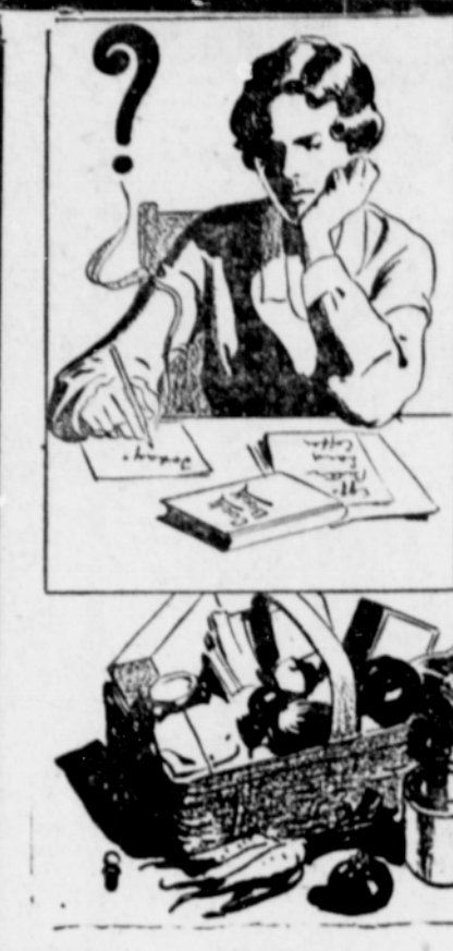
Fruits for Thanksgiving