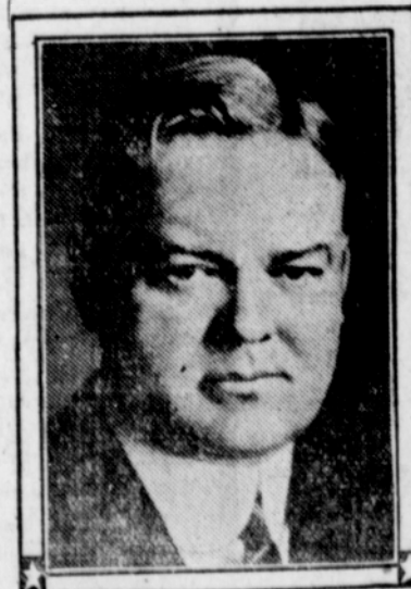
HERBERT HOOVER for PRESIDENT