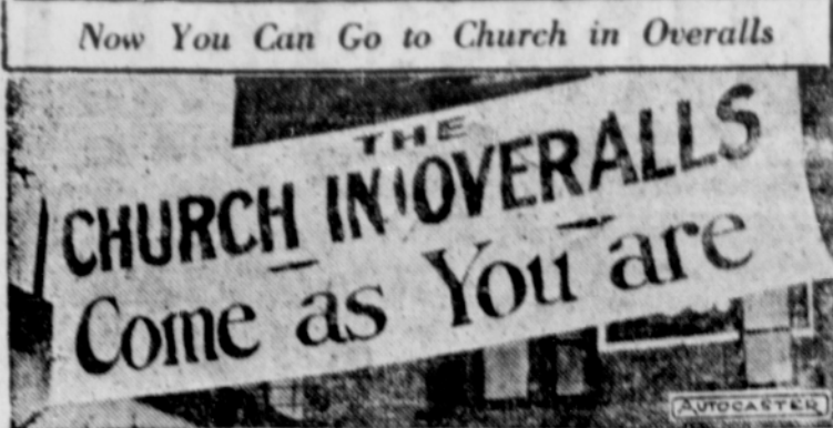
Photo shows the big banner over the Open Air Canvas Church at 5th and Wyndotte Streets, Kansas City, Mo., that is making a go-to-Church Sunday Drive and wants the members of its congregation to come dressed as they please and in overalls if they care to