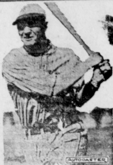
The fans love the brilliant playing of Travis Jackson, young shortstop of the New York Giants, who is field captain for the 1928 season. Jackson succeeds Rogers Hornsby as field captain.