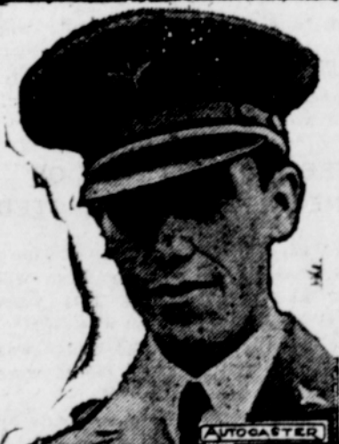
Captain Emilio Carranza, Mexican flyer, who was killed when his plane crashed near Burlington, N. Carranza, "good will" flyer who recently flew from Mexico City to Washington, was attempting a return flight to Mexico City, when the tragedy occurred. The Mexican Lindbergh, as he was called, is being widely mourned both in this country and in Mexico.