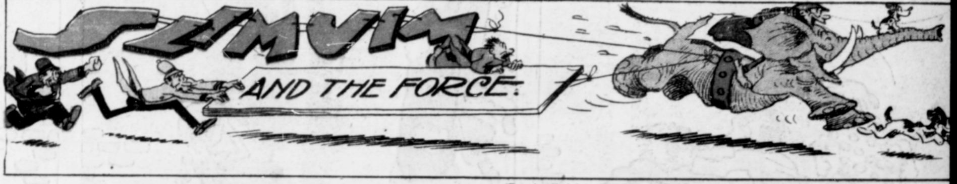
(Pat. Applied for—Serial No. 21764) The World Color Ptg. Co., St. Louis, Mo.

S LIM JIM'S UNCLE, BILL BARNACLE, COMES TO GRABVILLE WITH A MAP SHOWING WHERE PIRATE TREASURE IS BURIED NEAR THE TOWN. THE FORCE GET WISE TO THIS, AND ARE AS EXCITED AS A TOE-DANCER ON A HOT STOVE. SHARK-EYE , A TOUGH SHIPMATE OF BILL, HAS SEEN THE MAP AND IS HOT AFTER THE TREASURE. SHARK-EYE STEALS THE MAP!! BILL BARNACLE PROMISES THE FORCE PART OF THE TREASURE IF THEY WILL HELP TO CAPTURE SHARK-EYE , AND REGAIN THE MAP. FULL OF THRILLS! WATCH-FOR-IT!!