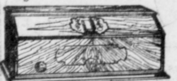
Model 11. The famous Zenith Scribble checks in a beautifully finished cabinet. Price, battery operated, $110. Electrically operated, $175.

That is why Zenith is the most logical choice in radio.