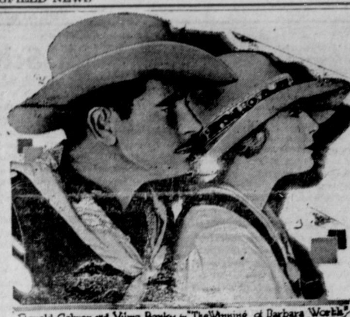
Ronald Colman and Vilma Banky in "The Winning of Barbara Worth"

Places have been reserved for 12 boys from Lane county. No obligations for future service in any component of the United States army attaches to attendance at citizens' military training camps.