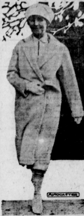
The President started it—these spring hikes. Now Mrs. Coolidge is showing the way in Washington's spring sunshine and she may be seen often on little shopping jaunts—for Easter toggergy—just a few weeks away, April 17.