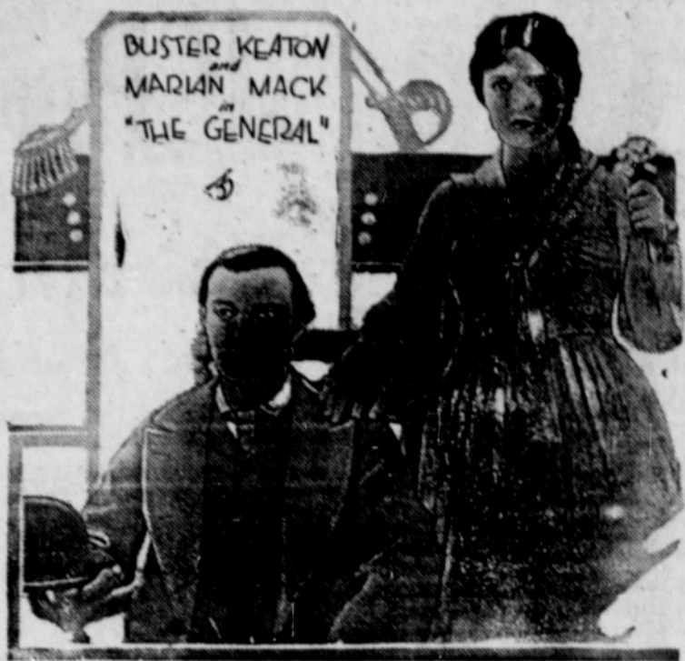
At Bell Theatre February 13 - 14 - 15