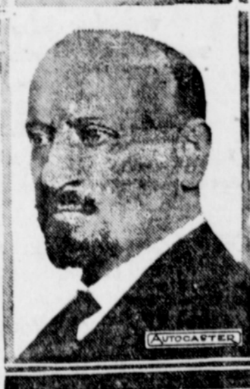
Representative George Holden Tinkham of Massachusetts demands that Attorney General Sargent prosecute the Anti-Saloon League for violation of Federal Corrupt Practices Act. He claims they spend huge sums to bring about prohibition.