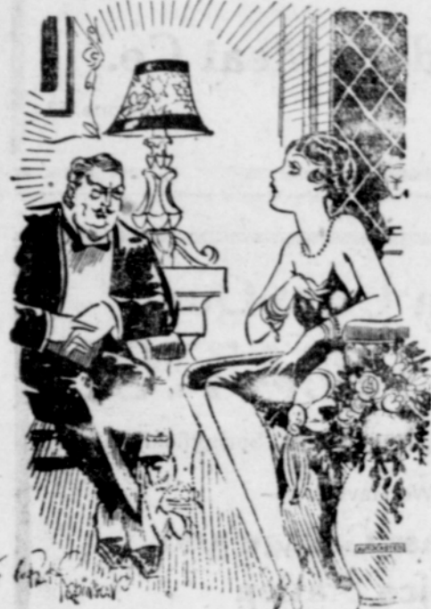
"But Father, it's so exciting having the admiration of men and Curtiss is always indifferent—now that he's so absorbed in his work."

Sallie's Father Takes Her in Hand about parties and er-good times." "What's the matter, Father? Has anything happened? You haven't heard from Curtiss, have you?" I questioned, with swift alarm at his unexpected appearance at the dance. "Nothing has happened, Sallie," he replied in a calm and reassuring voice, "but I want you to do something for me." "Of course I will. What is it Daddy dear?" "Would you mind coming home with me now instead of later with Ted? I've been doing a lot of thinking since our little chat tonight and I want to talk to you—that's all. You see, its nothing startling and besides," he attempted a smile, "I was invited to the dance." "All right, Dad, I'll meet you in a jiffy," I flung over my shoulder as I hurried towards the stairs, "tell Ted were going, if you can find him. He's probably parked with some pretty girl a mile from the place!" Reaching home we made our way to my father's study which was a privilege extended only on occasions enough but for a married woman it