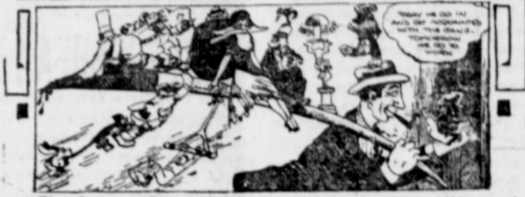
The famous "Rube" Goldberg will now draw a weekly comic strip cartoon for this newspaper, beginning with this issue. Mr. Goldberg has for years been one of America's highest paid cartoonists and we believe that our readers will be highly entertained by his clever and original work. Goldberg has originated more clever series than any other artist. Just now he has the country saying—"It's the boloney!" Look for Goldberg's comic every week in this newspaper.