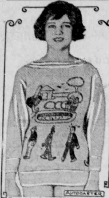
Gertrude Duell of New York is shown wearing a hand-decorated "sweat" shirt—a fad started by college track men. The girls have taken up the idea with enthusiasm and now its all the rage.