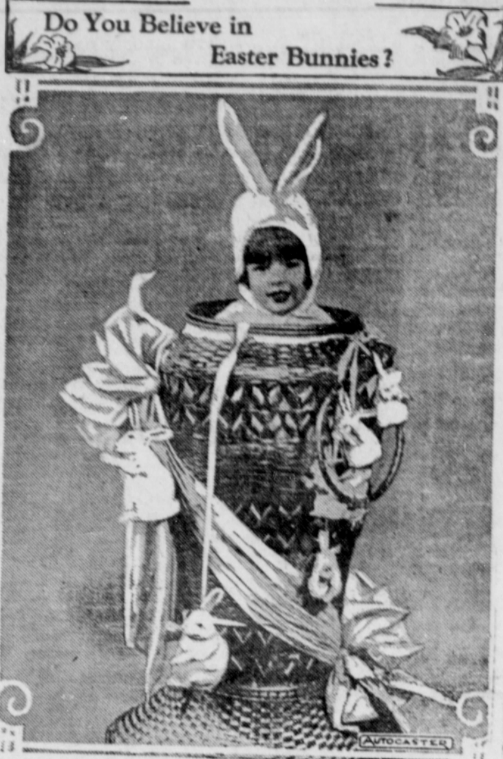
Do You Believe in Easter Bunnies?