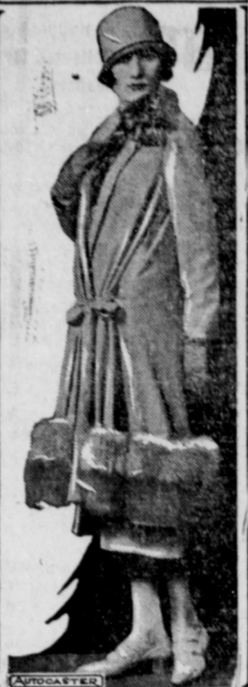
This ensemble costume in moose-antler stone is trimmed in two-tone fox. The frock is of henna and grey crepe. This is an American design made from American fabrics.

Hold Cafeteria —The Rebecca lodge sponsored a penny cafeteria held at the I. O. O. F. hall Monday night. Salads, sandwiches, coffee, cakes and other items of food were sold.