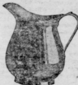
2 1/2 quart heavy water pitchers—plain