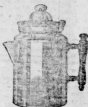
6 and 8 cup coffee percolators paneled and plain.