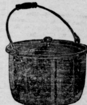
Covered kettles with safety draining device on cover. 5 quart size