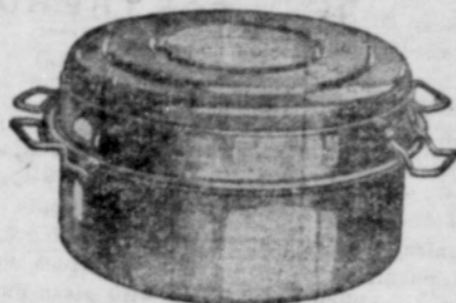
Small and medium round roasters worth $1.48

EVERY PIECE NEW! EVERY PIECE PERFECT! ALL GOOD WEIGHT! ALL PRICED 'WAY LESS THAN WORTH! ATTEND THIS SALE AND SAVE THE DIFFERENCE!