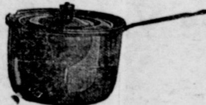
Sauce pans with wooden handles, 3 quart "lifetime" aluminum