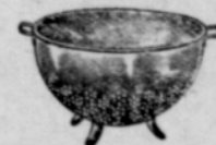
Heavy aluminum colanders in a large convenient size. Just like the one illustrated.

Cafeteria trays—very handy to use for cocky sheets—extra heavy, worth $1.48