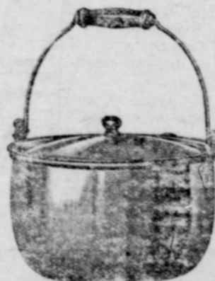
5 and 6 quart covered kettles, very special.