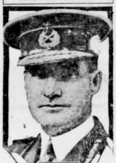
London-Maj. Gen. Sit Lee Stack, British commander in the Sudan, has asked for reinforcements to maintain order at Athara, where the British garrison was fired upon by native troops. Gen. Stack's photo is shown above.