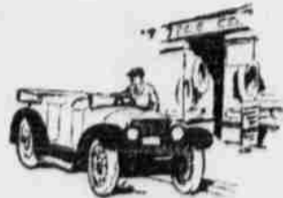
"You get a fresh, live tire every time you buy a U. S. Tire."

A sound reason for the fact that you see more U. S. Tires on more cars than ever this year.