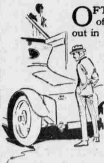
"Any U. S. Tire is a universal full-money's worth."

O FTEN it's surprising the number of different tire views that come out in a chance talk at the curb or in the leisure of a friend's garage.