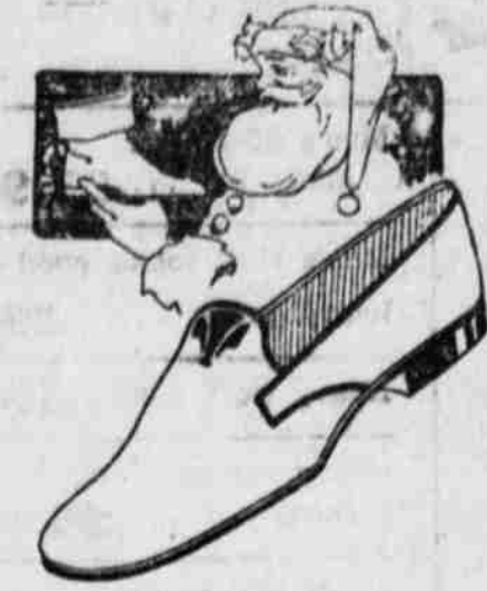
A Man may be a "boy grown up" but he certainly is past the "tin whistle" age and he appreciates most, something nice to wear.

We have made a special effort this year to stock our store with gifts that will carry with them all the atmosphere of the holidays.