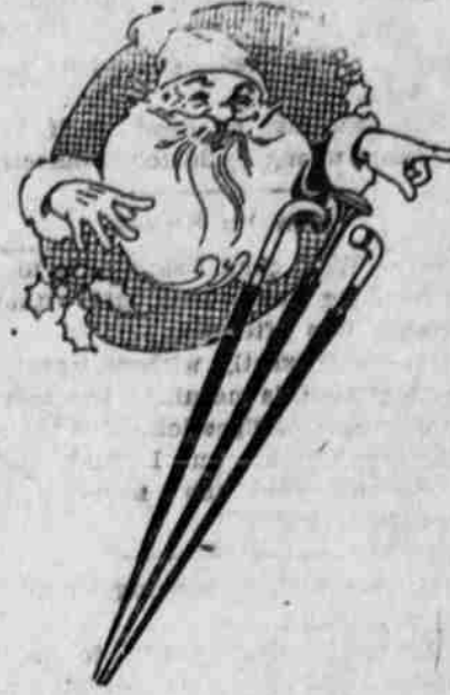
Parasols are both a dainty and practical gift for women. There are also good Umbrellas for men.