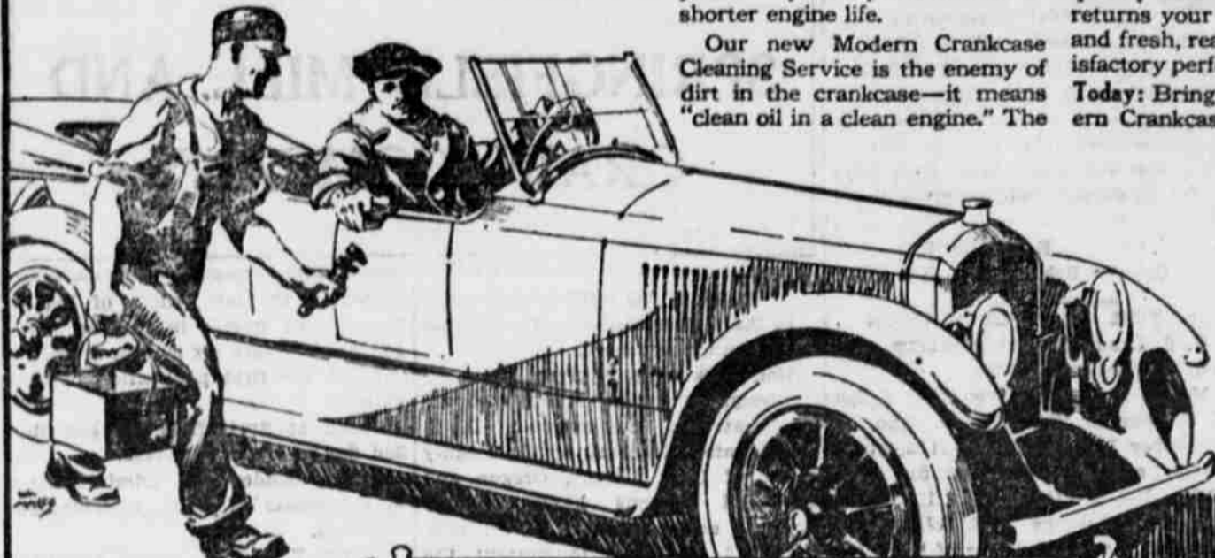
"For clean oil in a clean engine"

new, scientific, thorough flushing agent that does not contaminate the fresh Zerolene refilled into your cleaned crankcase. This modern, convenient service, given quickly and at a nominal cost, returns your engine to you clean and fresh, ready to give that satisfactory performance you expect. Today: Bring in your car for Modern Crankcase Cleaning Service.