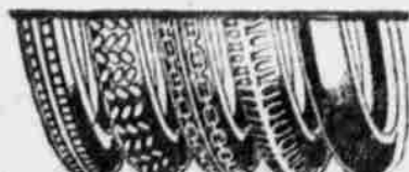
ROYAL CORD - NOBBY - CHAIN - USCO - PLAIN

For best results—everywhere—U. S. Royal Cords.