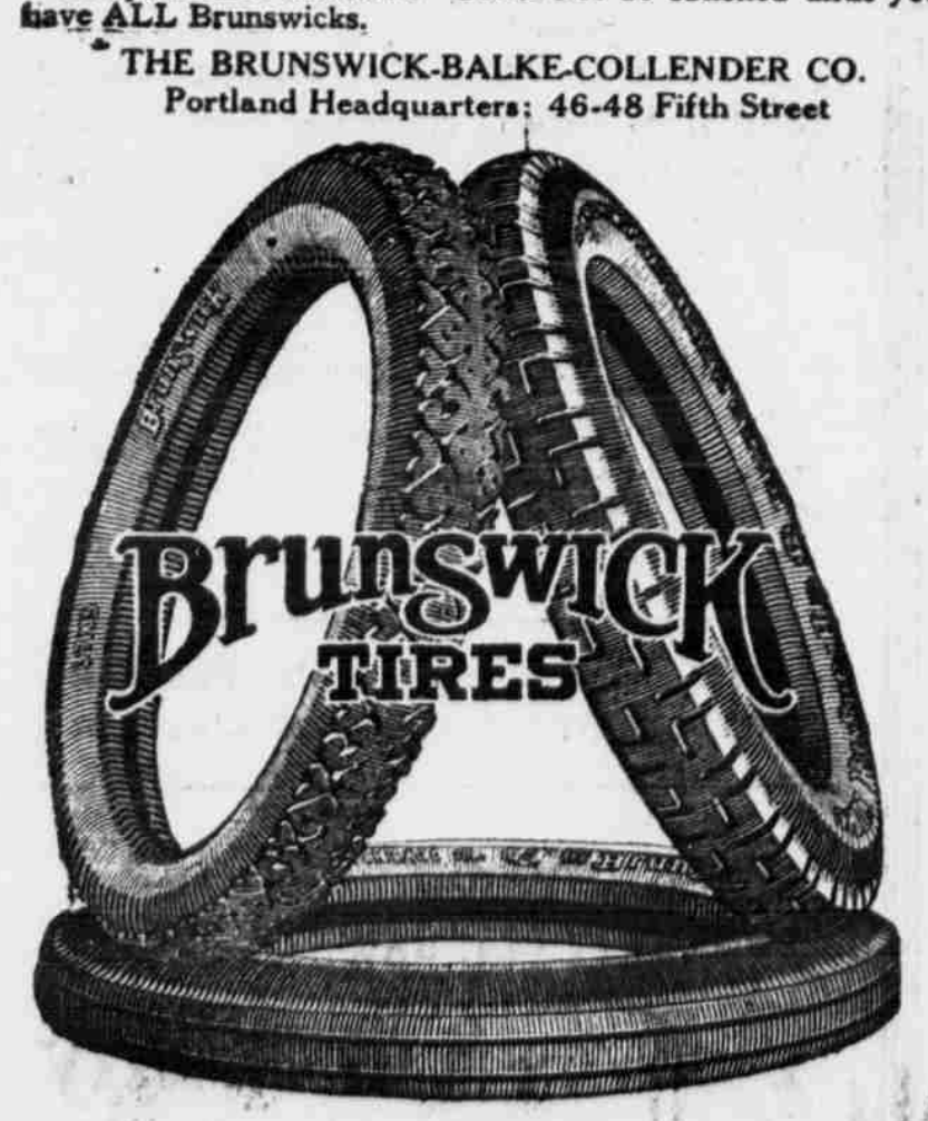
Sold On An Unlimited Mileage Guarantee Basis