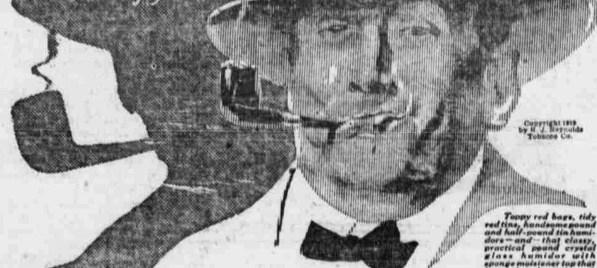
Copyright 1919 by R. J. Reynolds Tobacco Co.

Tasty red bags, tidy red tins, handsome pound and half-pound tin tins— and— that classy, practical pound crystal glass humidifier with sponge moisture top that keeps the tobacco in such perfect condition.