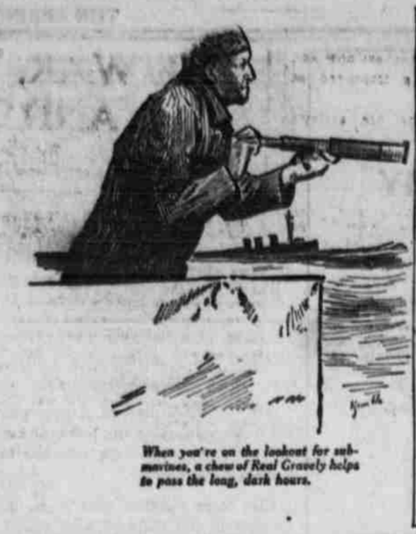
When you're on the lookout for submarines, a chew of Real Gravely helps to pass the long, dark hours.