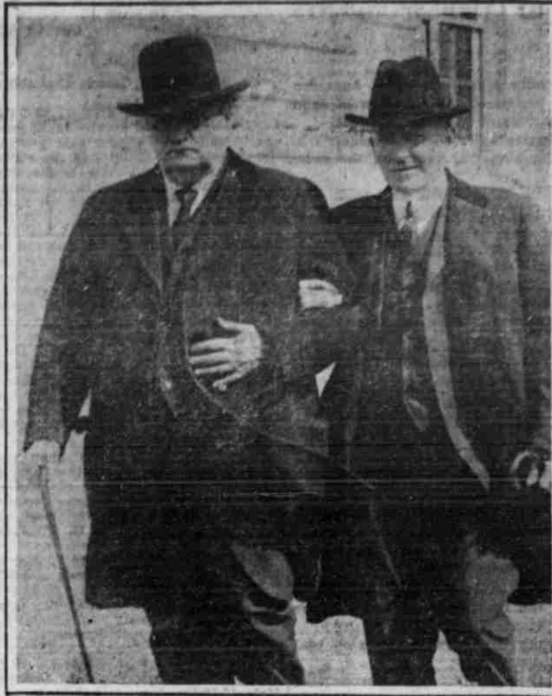
When congress meets in special session on April 7 a father and son will sit together, a very rare case in our history. They are Senator John H. Bankhead and Representative Elect William B. Hankhead from Alabama.

Cleaning, Pressing REPAIRING Made to Measure Suits Lemley Suit House Phone 75