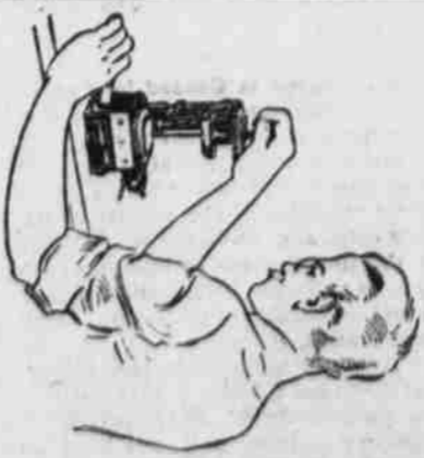
This little machine is used in cutting lenses to any desired shape and size. The cutting is accomplished with a diamond set in the machine.