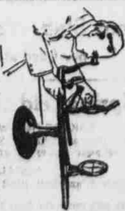
With this instrument the operator locates the optical center of the lens and also marks the axis of the cylinder, if any. It is also employed to check the accuracy of every completed pair of glasses. We call it the "policeman" of the shop.