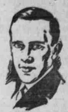
BUD FISHER Famous Cartoonist, says: "Tuxedo has made a pipe my favorite form of smoking. Its coolness and mildness make pipe-smoking a real pleasure." Bud Fisher

Bud Fisher jumped the old-time rut when he invented Jeff and Mutt. For years, with that amusing pair, he's chased away the people's care, and made them laugh and throw their hats, and cackle till they broke their slats. The tired, the sad, the weak, the worn, have laughed with Bud, and ceased to mourn; the lame, the halt, the blind, the deaf, have whooped with glee o'er Mutt and Jeff. Where does he find the joyous jests which break the buttons from our vests? You'd think the fount would have to fall, but never once has he been stale. When he sits down to hatch a plot in which his heroes will be caught, he lights his pipe, and soon a joke emerges from Tuxedo smoke. He swears by "Tux" and so will you, when you have tried a jar or two.