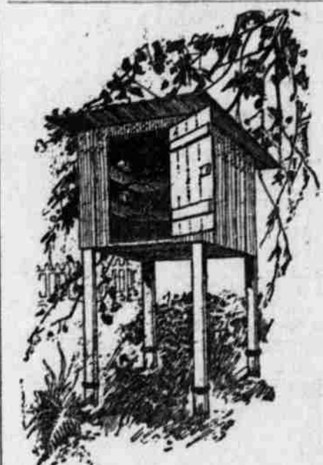
A FRESH AIR FOOD SAFE.

Pantry requirements are a trifle paradoxical, in that they are air and light and darkness. A pantry window is essential, even if it be no more than a tiny two-light sliding sash, set anyhow in the outer wall. A regular window is much better. It need not waste wall-space-shelves, but can be so placed across it as to admit its working. But