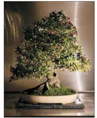
WINTER BONSAI. The Pacific Bonsai Museum in Federal Way is illuminating its world-renowned bonsai collection in a serene display of holiday magic during Winter Bonsai Solstice. The one-day event takes place on December 16 from 4:00pm to 7:00pm.