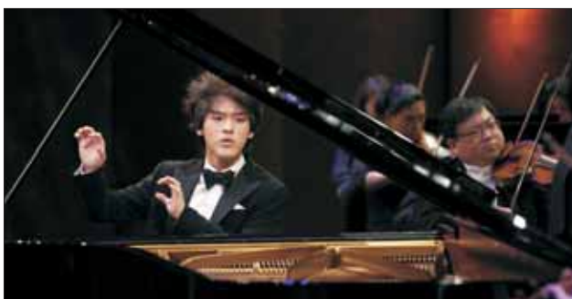
MARVELLOUS MUSICIAN. Yunchan Lim of South Korea performs a concerto with the Fort Worth Symphony Orchestra in the final round of the 16th Van Cliburn International Piano Competition at Bass Performance Hall in Fort Worth, Texas, on June 12, 2022. The 18-year-old won the competition, one of the top showcases for the world’s best pianists.

The competition was founded in 1962 in honor of the celebrated pianist Van Cliburn, who lived in Fort Worth. Cliburn, who died in 2013 at age 78, played for U.S. presidents, royalty, and heads of state around the world.