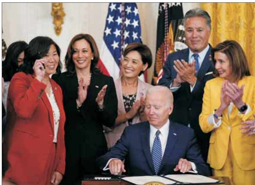
APA HISTORY & CULTURE. Representative Grace Meng (D-N.Y.) holds up a pen given to her by President Joe Biden during a bill signing ceremony for the “Commission to Study the Potential Creation of a National Museum of Asian Pacific American History and Culture Act” on June 13, 2022 in the East Room of the White House in Washington, D.C.. Also on stage are Vice President Kamala Harris, second from left, representatives Young Kim (R-California) and Mark Takano (D-California), and House Speaker Nancy Pelosi of California.

Biden was joined at the ceremony by Vice President Kamala Harris, the first person of Indian descent to be elected to the position. Harris’ mother