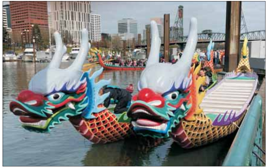
ROSE FESTIVAL RETURNS. Portland Rose Festival dragon boats are seen at the RiverPlace Marina dock in downtown Portland prior to the "Awakening of the Dragons." The eye-dotting ceremony of the dragon boats introduced the ornate dragon boats and their teams to the Willamette River and started the preseason practice schedule leading up to the races, which are scheduled during the weekend of June 11 and 12, 2022.

Following a blessing ceremony, attendees watched dignitaries paint red dots on the eyes of the eight dragon boat figureheads to officially "wake" them up. Attendees were also treated to a water cannon salute by the Portland Fireboat.