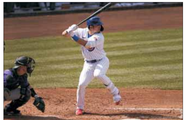
SUZUKI SIGNING. Seiya Suzuki of the Chicago Cubs tosses a ball to fans (top photo) and bats (bottom photo) during a spring training baseball game against the Colorado Rockies on March 25, 2022 in Mesa, Arizona.