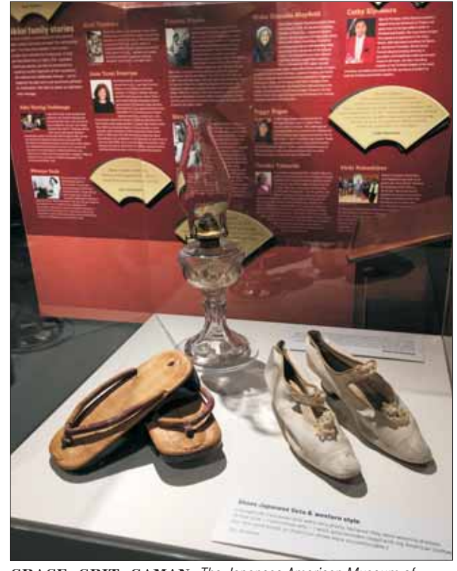
GRACE, GRIT, GAMAN. The Japanese American Museum of Oregon is presenting "Grace, Grit and Gaman: Japanese-American Women through the Generations," a new exhibit that shares the rarely revealed story of the grace, grit, and gaman (perseverance) of Japanese-American women. The display is featured through December 31, 2021.

Visitors to Lan Su Chinese Garden on June 12 and 26