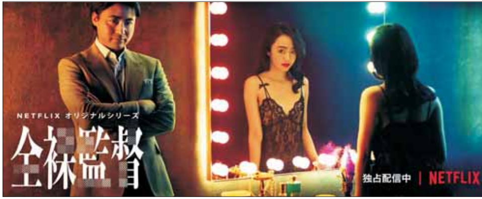
NEW ON NETFLIX. This image released by Netflix shows Takayuki Yamada, left, who stars in "The Naked Director," striking a pensive pose with co-star Misato Morita. The key challenge for Netflix in Japan lies with producing attractive original content, and featuring directors, actors, and writers out of Japan, not just licensing Japanese TV shows and movies.